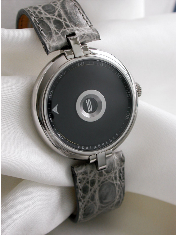
Vincent Calabrese Sun-Tral